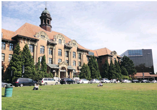
John Abbott College helps bring an interesting mix of people, energy and ideas to Ste-Anne-de-Bellevue.