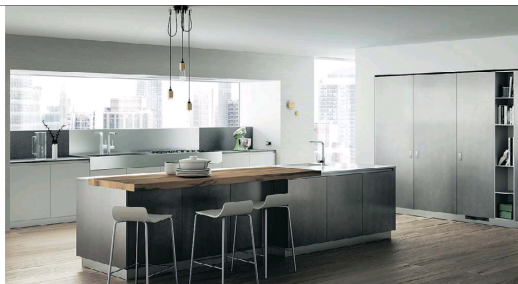
A trendy colour is used in this kitchen design: stained-look lacquered doors in Stained Steel for the island and cabinets, Light Grey matte lacquered doors for the work area and open-fronted tall units, stainless steel for work-tops.

"It's worth investing in because having nice-looking cabinetry is very important," Daniela Lamorte said. "The cabinets physically take up the most space in kitchens; it's very prominent, so it is usually the first thing buyers notice."