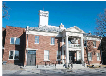
Ste-Anne-de-Bellevue town hall, at 109 Ste-Anne St.