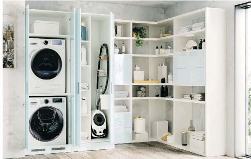
Scavolini's Laundry Space collection, with its combination of the appliance unit (housing the washing machine and dryer) and the storage cupboard with the Fluida wall system, in a corner configuration and fitted with bottoming flap doors and baskets, is the perfect solution for managing all your cleaning and washing essentials.